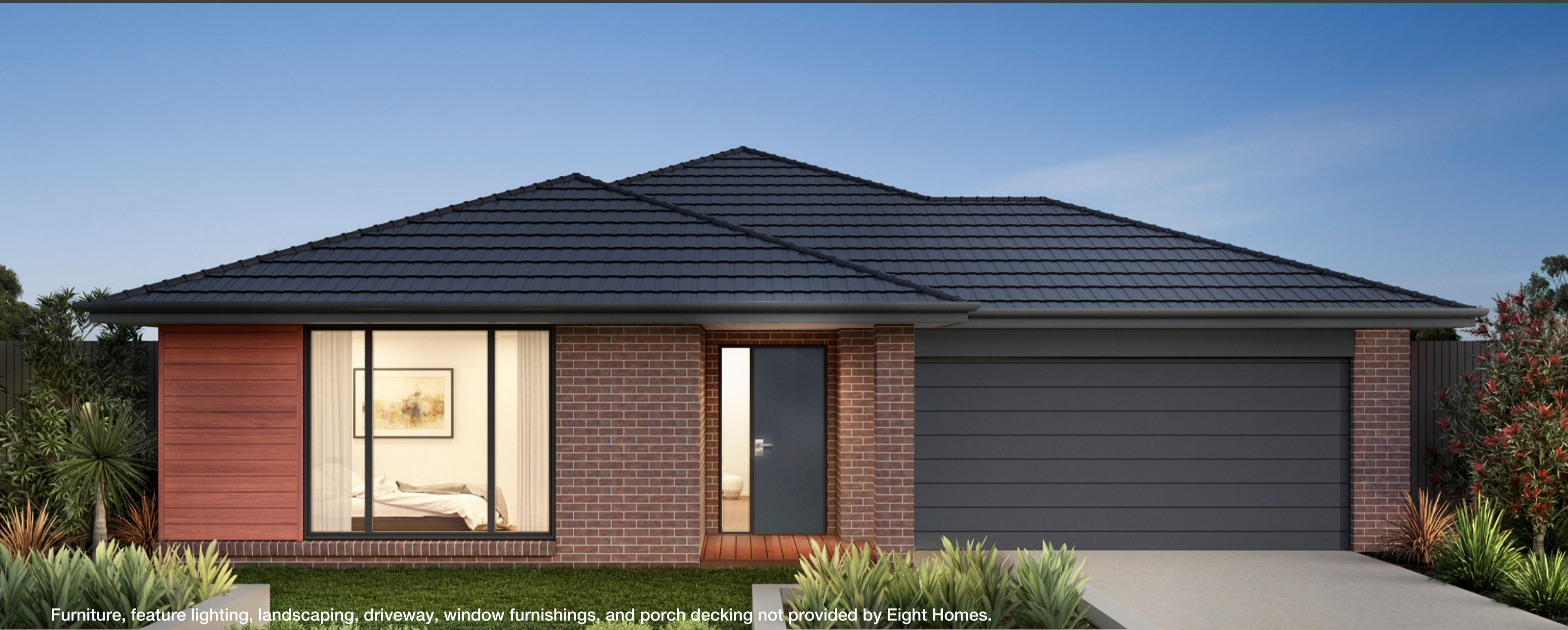
Furniture, feature lighting, landscaping, driveway, window furnishings, and porch decking not provided by Eight Homes.

Price includes standard floorplan with S1 facade.