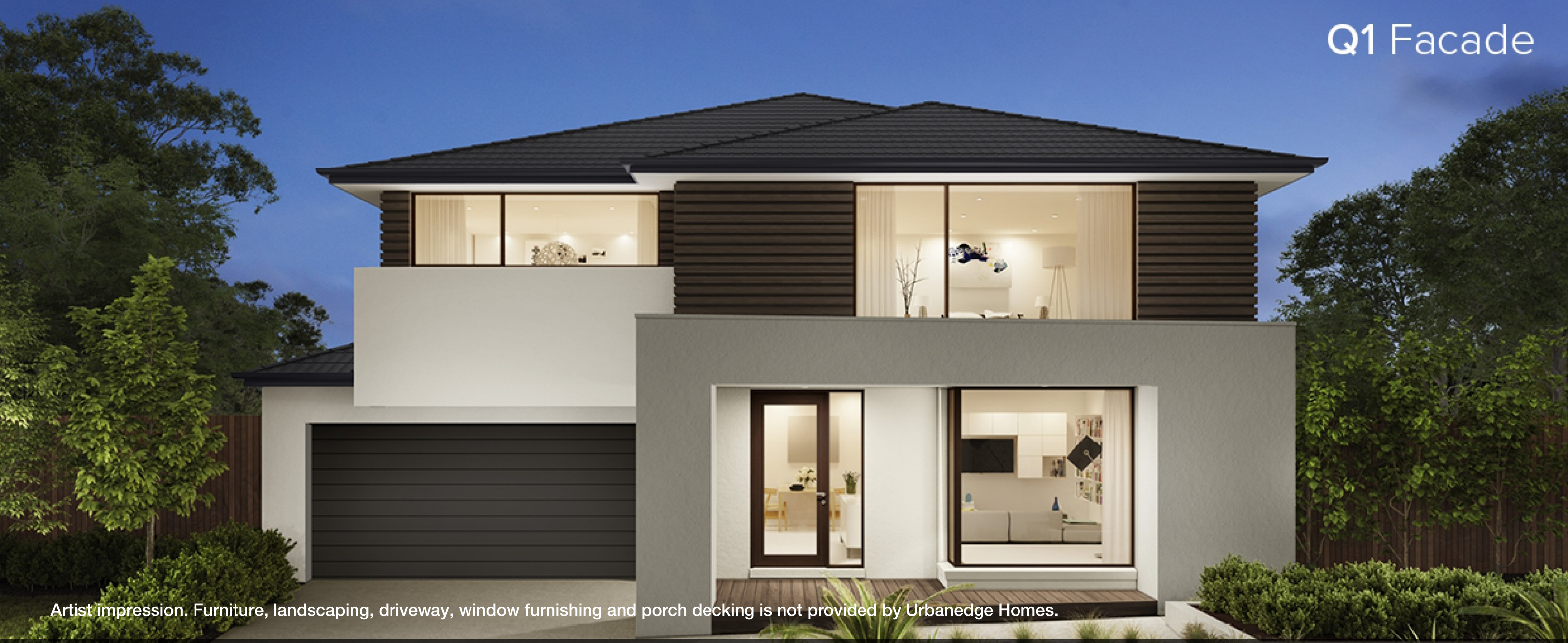
Artist impression. Furniture, landscaping, driveway, window furnishing and porch decking is not provided by Urbanedge Homes.