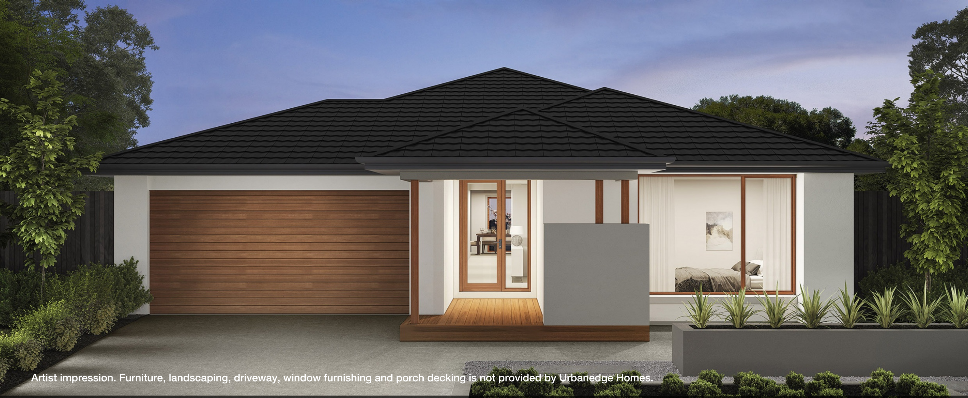
Artist impression. Furniture, landscaping, driveway, window furnishing and porch decking is not provided by Urbanedge Homes.

Price includes standard floorplan with STANDARD facade.