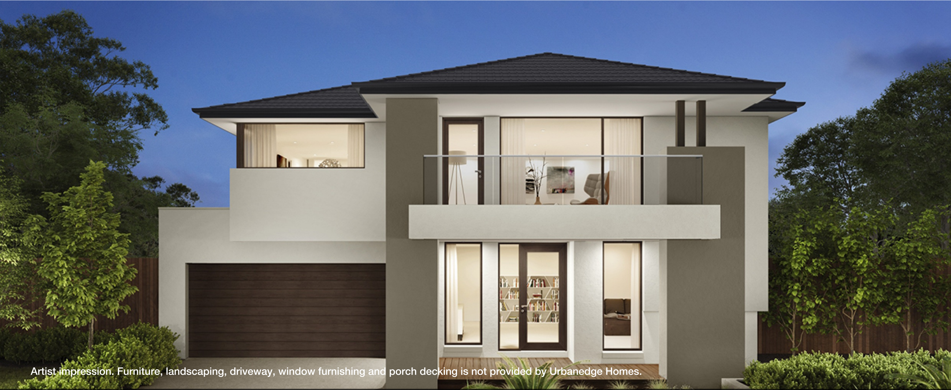
Artist impression. Furniture, landscaping, driveway, window furnishing and porch decking is not provided by Urbanedge Homes.

Price includes standard floorplan with Q8SANAFACADEUE116DBG facade.