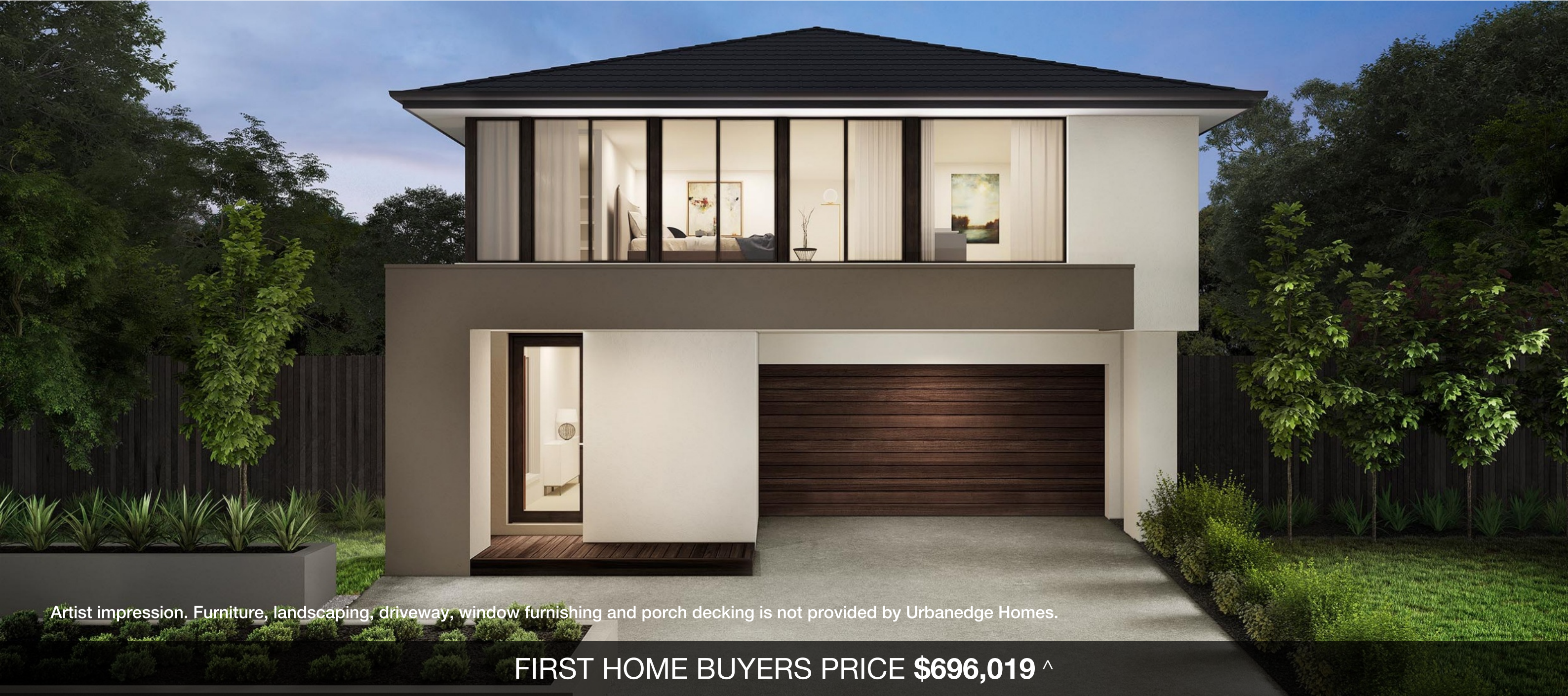
Artist impression. Furniture, landscaping, driveway, window furnishing and porch decking is not provided by Urbanedge Homes.

Price includes standard floorplan with LD - 107DBG facade.