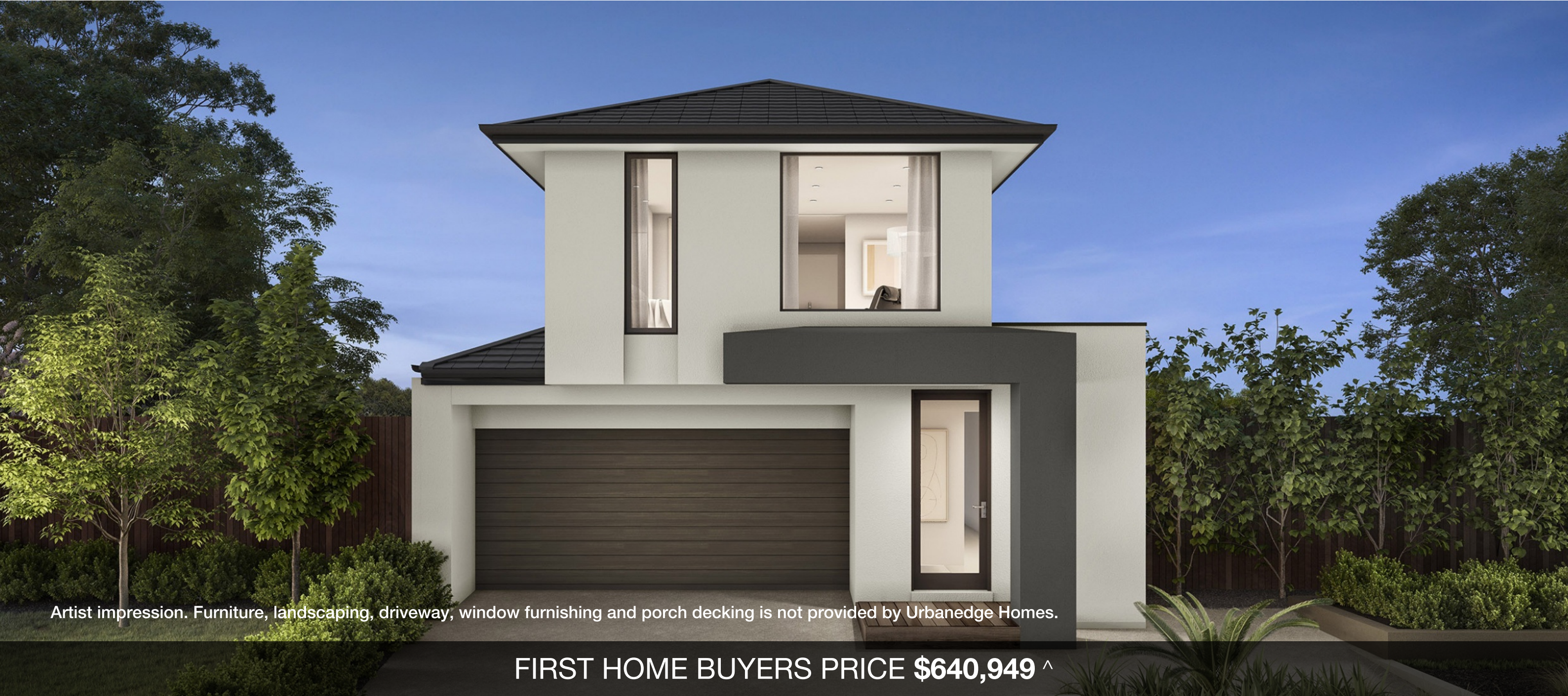
Artist impression. Furniture, landscaping, driveway, window furnishing and porch decking is not provided by Urbanedge Homes.

Price includes standard floorplan with STANDARD-RYLAN-21 facade.