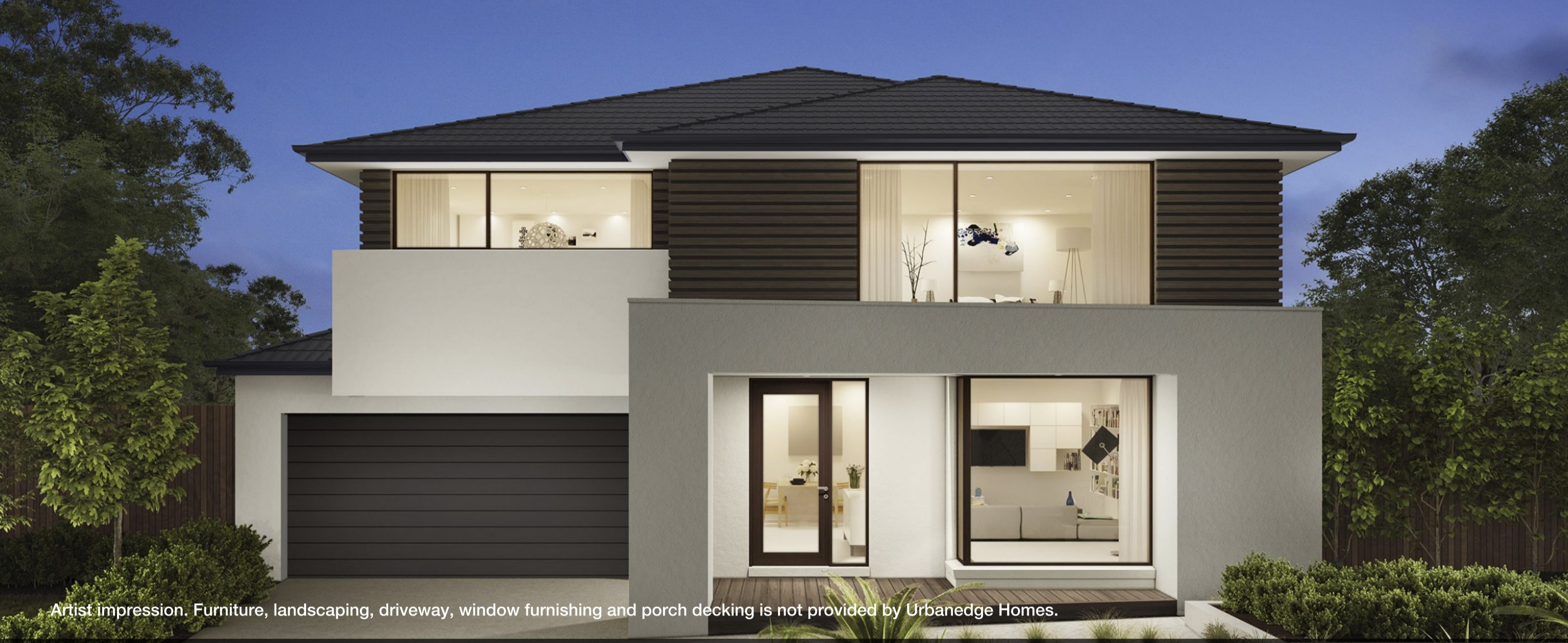
Artist impression. Furniture, landscaping, driveway, window furnishing and porch decking is not provided by Urbanedge Homes.

Price includes standard floorplan with Q1-BUILD OVER facade.