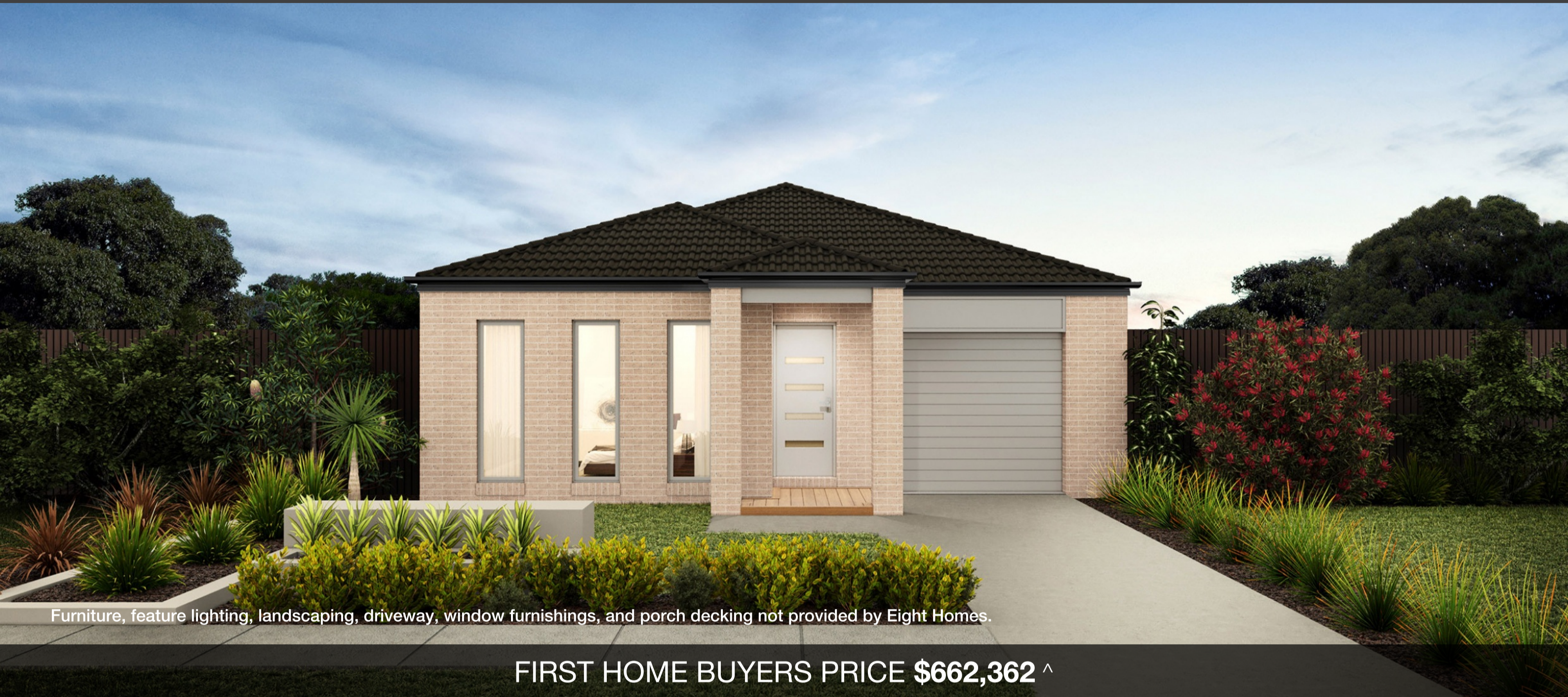
Furniture, feature lighting, landscaping, driveway, window furnishings, and porch decking not provided by Eight Homes.

Price includes standard floorplan with S1 facade.