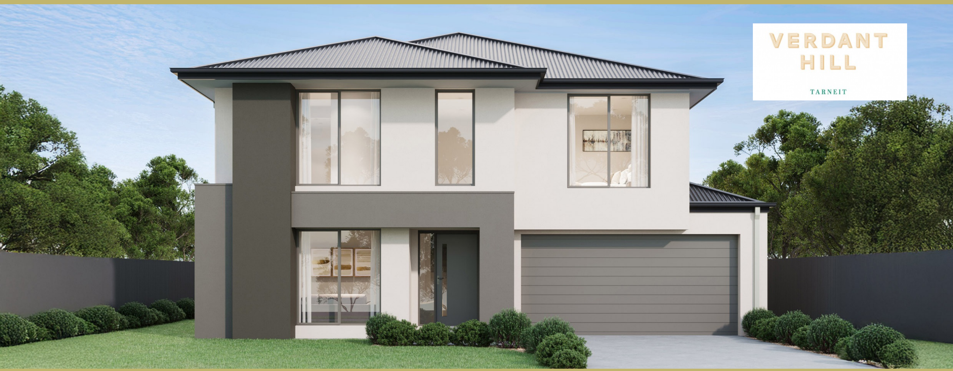
VERDANT HILL TARNEIT